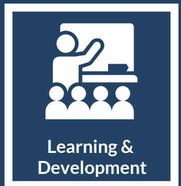
Learning & Development

Internal Mobility Team Design Strength & Weaknesses Benchmarking